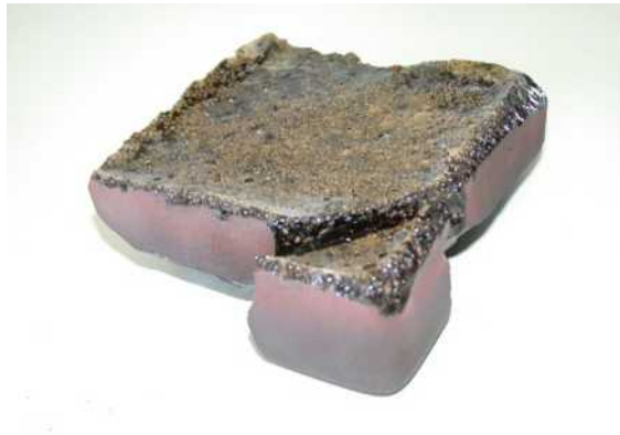
Test block made at ECN