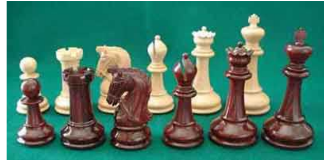
White pieces from combustion fly ash Black pieces from gasification fly ash