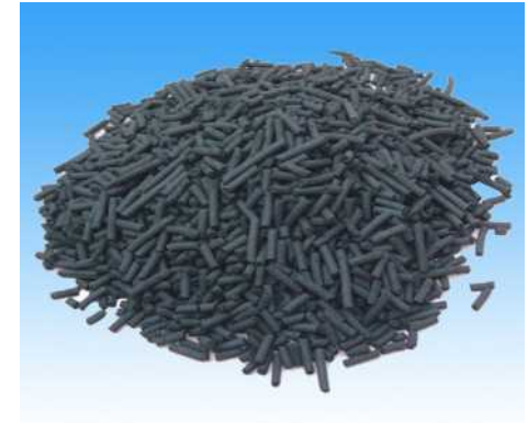
Fuel pellets from high-C fly ash