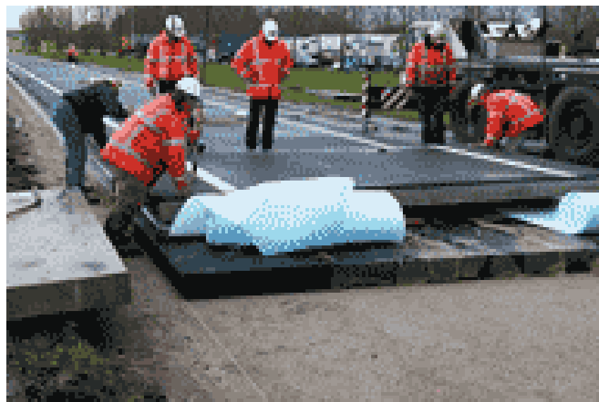
C-fix blocks as underlayer in road construction