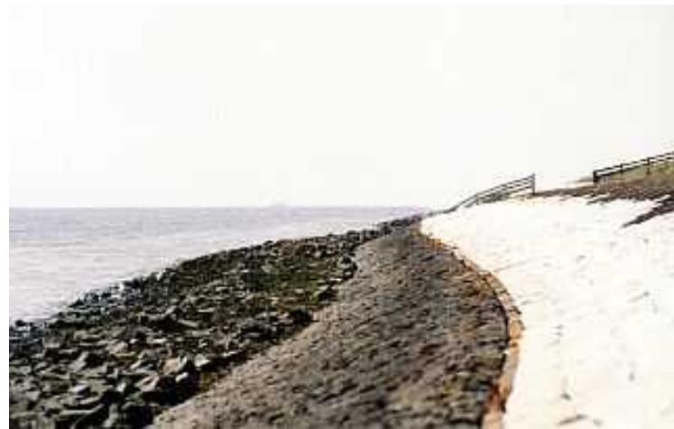
Basalt blocks used to protect sea walls